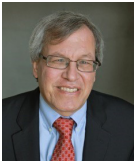
Erwin Chemerinsky Dean and Jesse H. Choper Distinguished Professor of Law Berkeley Law